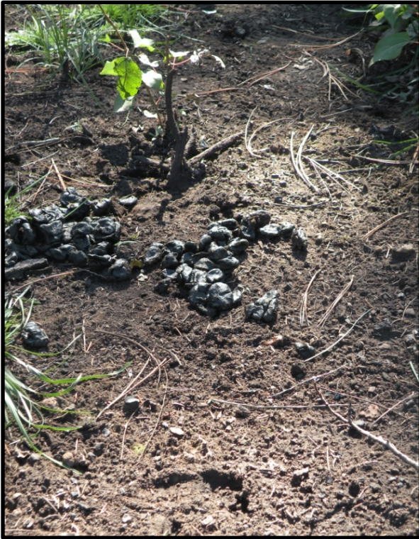
Elk scat and browsed aspen sucker following a wildfire in Arizona.

3) Aspen abundance : The density and extent of aspen also matters, with large, dense stands generally regenerating better. Whereas the fires in Yellowstone in 1988 were large and severe, there was still significant aspen and willow decline due to herbivory because there was limited browse material in this landscape to begin with. We have observed similar problems in southern Utah where patchy aspen stands regenerating after fire are browsed heavily even when ungulate populations are moderate.