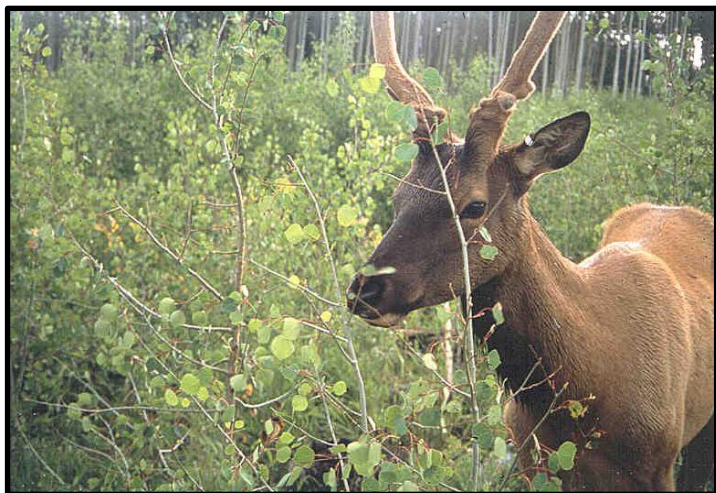
Elk browsing aspen

Aspen plays a fundamental role in facilitating post-disturbance re-establishment of forest communities, but intense browsing by ungulates can be detrimental to aspen establishment and recruitment (Seager et al. 2013). A regional survey of aspen understories across central and southern Utah showed that approximately 40% of aspen stems display evidence of browsing. Incidence and severity of browsing vary, suggesting that there are multiple factors that influence aspen browse susceptibility. However, aspen forests only require 500 to 1,000 suckers per acre to escape herbivory and recruit into the overstory for the stand to persist.